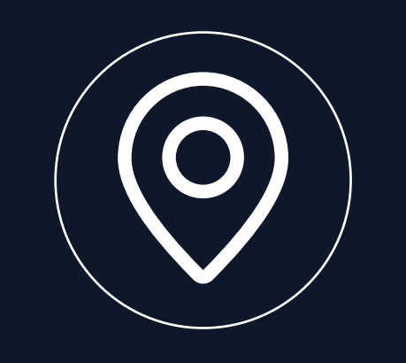
GPS/GLONASS/ Huada Beidou