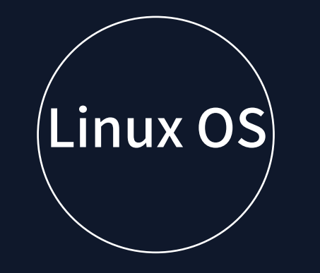
Ubuntu Operating System