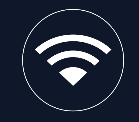
Dual frequency Wi-Fi